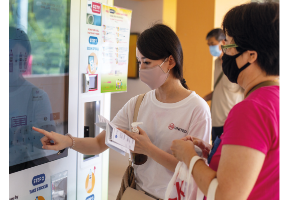
Temasek Foundation's second #BYOBclean initiative saw Singapore households collecting free, zero alcohol hand sanitiser from vending machines.

Our people have volunteered to support our community response towards COVID-19, and other activities to extend a helping hand to the vulnerable.